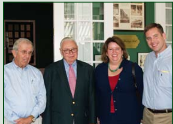
MPHS visits Grand Hotel and Mackinac Island