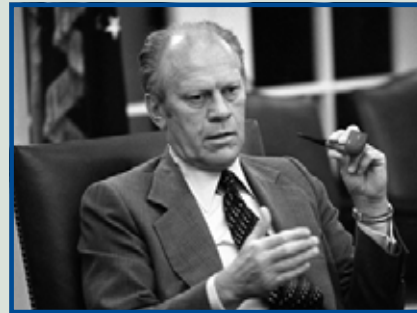
President Gerald R. Ford

been good to America, especially during difficult times. At the time of the Civil War, he gave us Abraham Lincoln. And at the time of Watergate, he gave us Gerald Ford--The right man at the right time who was able to put the Nation back together.” President Ford was not only successful in the healing process, he was successful in dealing with significant national and international issues during his relatively short time in office. His actions during mounting tensions in the world restored equilibrium to America and confidence in its international role and began the end of the Cold War. Domestically, he dealt with a devastating recession and stabilized the United States economy. In resolving these and numerous other issues, he utilized the courage of his convictions placing the national interest above all else, including politics.