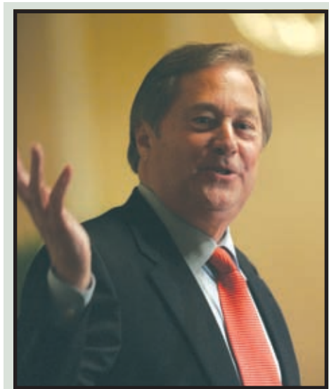
Governor James J. Blanchard

The crowd began arriving at 5:30 reception. The scene was one of jubilation; some attendees had not seen each other for several years. While the majority of attendees were from the Lansing or Detroit areas, a good number had traveled from out of state. They ranged in age from ten to ninety-seven years old. Some had known Governor