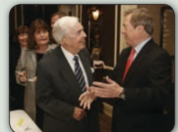
Governor Blanchard and Frank Kelley