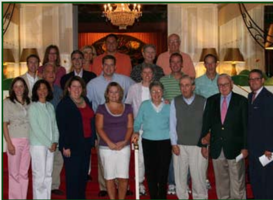
MPHS members .....