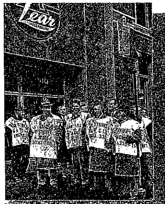
Walter Reuther at the Lear strike (UAW local 330), Grand Rapids, 1956.

merged in 1955, and Michigan followed three years later. National CIO President Walter Reuther played a major role in Michigan politics and labor. Reuther under-scored the labor movement's commitment to the political process when he said that "we are workers and we are citizens, and politics is the practical housekeeping of democracy and the American labor movement intends to help