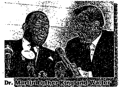
Dr. Martin Luther King and Walter Reuther during the 1963 civil rights rally in Detroit.

Gus Scholle sued in court to have the system of creating legislative districts declared unconstitutional. In 1969 the U.S. Supreme Court ruled in his favor. The resulting change in the make up of the state legislature brought passage of many progressive laws in the '60s. (See Tom Down's article in this edition of the News for details).