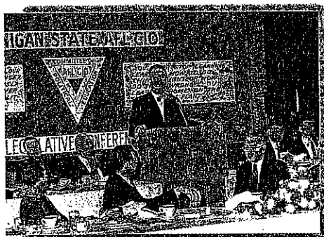
Governor G. Mennen Williams speaks at a 1959 Michigan State AFL-CIO Legislative Conference.